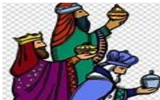
Prayer Service to mark the

Participating in Epiphany traditions, such as attending Mass, sharing special meals, and engaging in acts of kindness, can help Irish teenagers deepen their faith and connect with their heritage. Epiphany offers a meaningful opportunity for spiritual renewal and community bonding, fostering a sense of belonging and purpose in their lives.