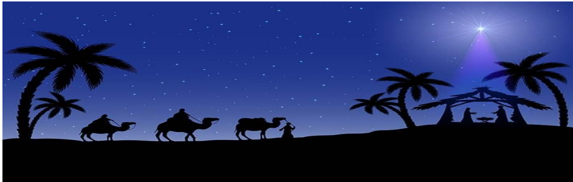
Gospel Reading: Matthew 2:1-12 [Good News Bible] Visitors from the East

Now when Jesus was born in Bethlehem of Judea in the days of Herod the king, behold, wise men from the East came to Jerusalem, saying, "Where is he who has been born king of the Jews? For we have seen his star in the East and have come to worship him." Matthew 2:1-2, RSV