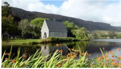
Gougane Barra, County Cork