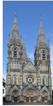
St. Finbarr's Cathedral