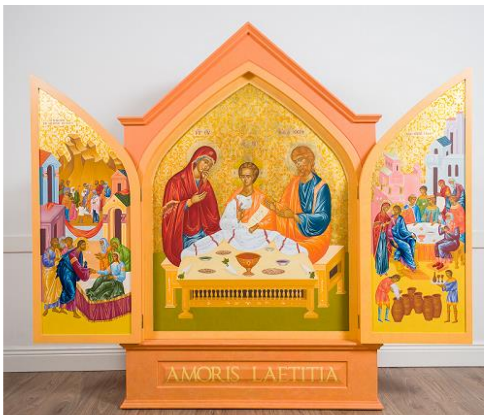
Icon of the Holy Family © World Meeting of Families 2018