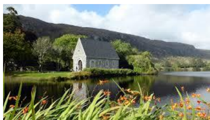
Gougane Barra, County Cork