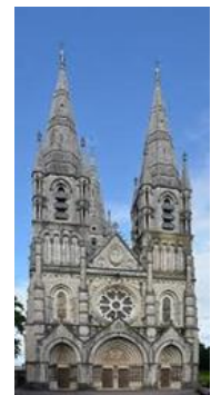
St. Finbarr's Cathedral